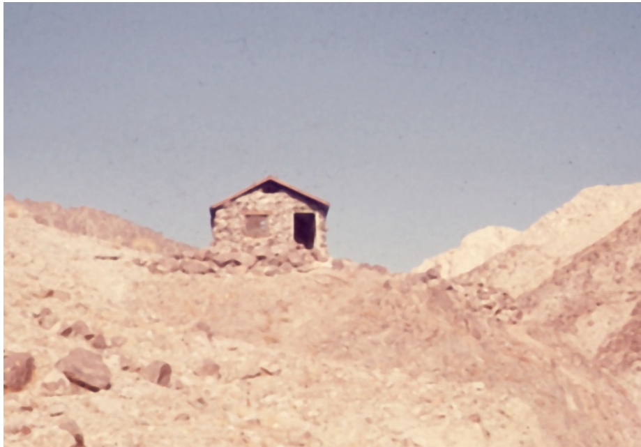
Stone structure at the Alvord mine.