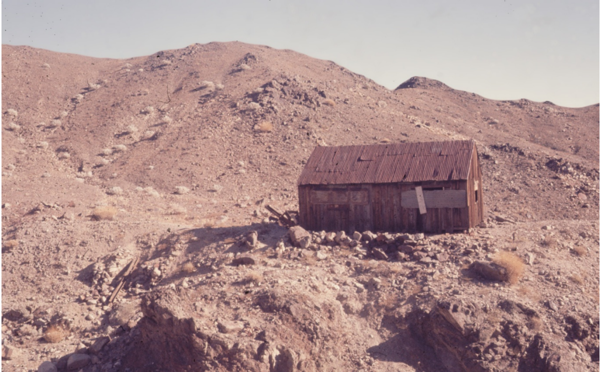
Wooden structure at the Alvord mine.