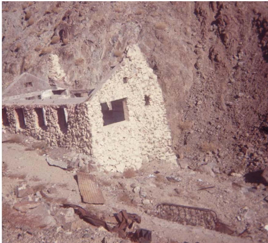
Stone structure at the Alvord mine.